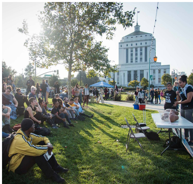
Earthquake preparedness and first aid instruction at the Stop Urban Shield 2017 Community Preparedness Fair.