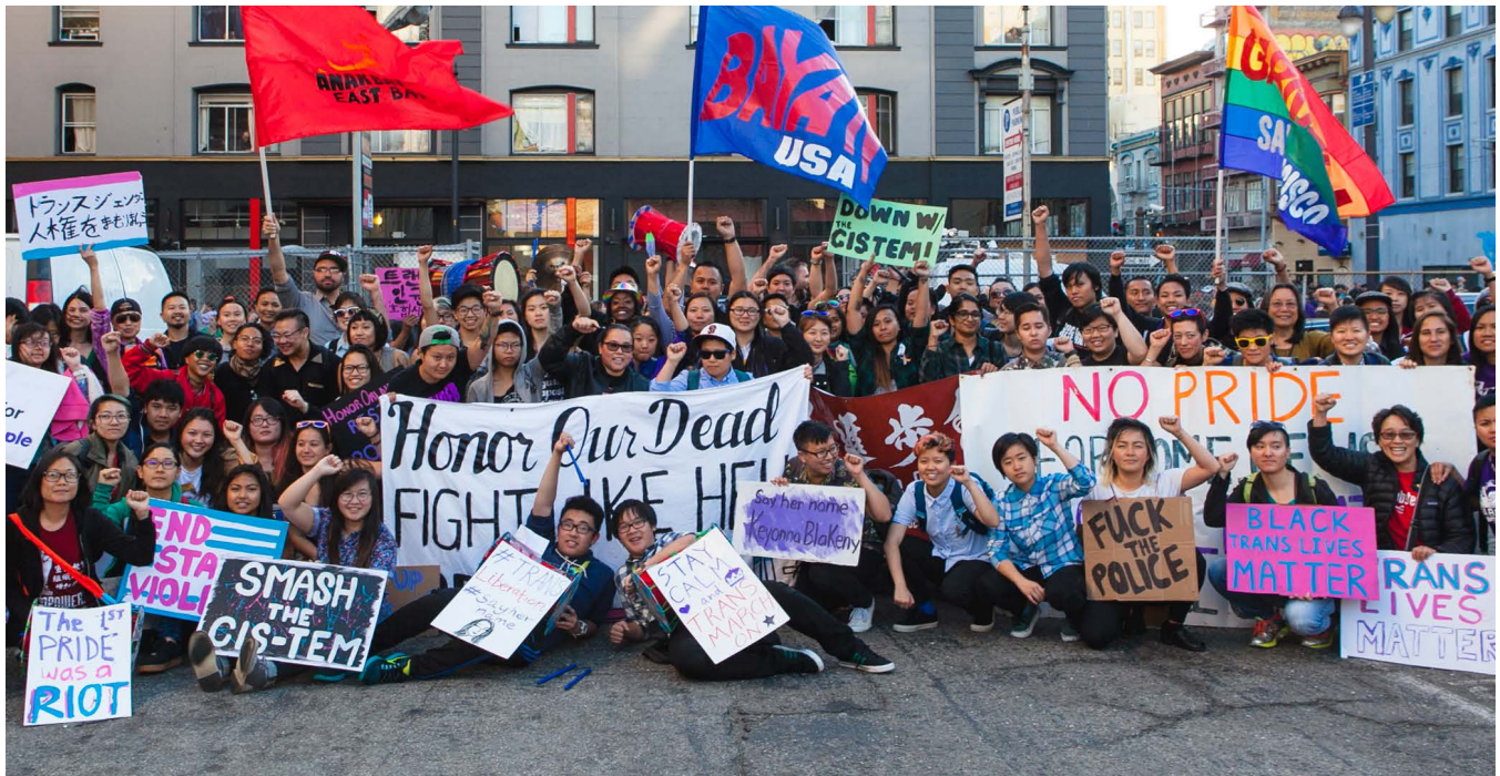
API Equality at the Trans March.