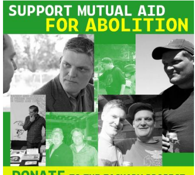
DONATE TO THE ZACHARY PROJECT

Your incredible gifts in 2020 and 2021 sustained a year of many requests. We hope to sustain our broader outreach about the fund so people continue to utilize it. Therefore, we must replenish the fund after a big year of mutual aid ($10,000 in 2021) and do some fundraising together.